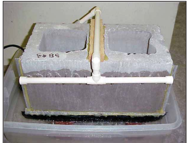
Figure 2—Specimen Undergoing the Spray Bar Test Method

While the water uptake test may be very good at distinguishing between the levels of resistance to absorption uptake, it will not indicate compaction or other flaws that might result in pinholes. Therefore, it is recommended that the results of this test be used to complement the results of the spray bar test and not used exclusively as a means of evaluation.